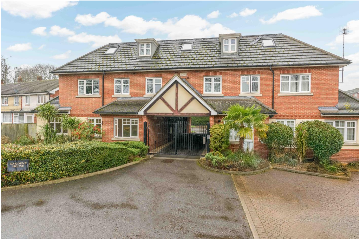
6 Oakdene House Brighton Road Addlestone Surrey KT15 1PH